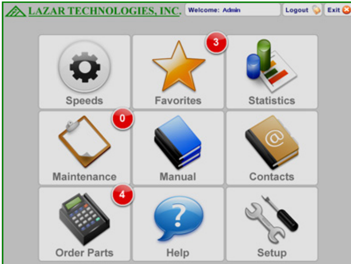
Home-screen of the HMI Lazar-Touch.