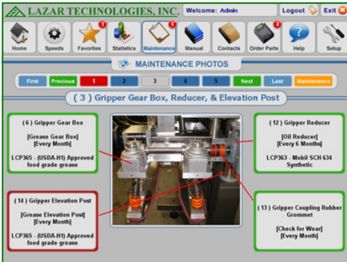
"Maintenance" section of the HMI Lazar-Touch.