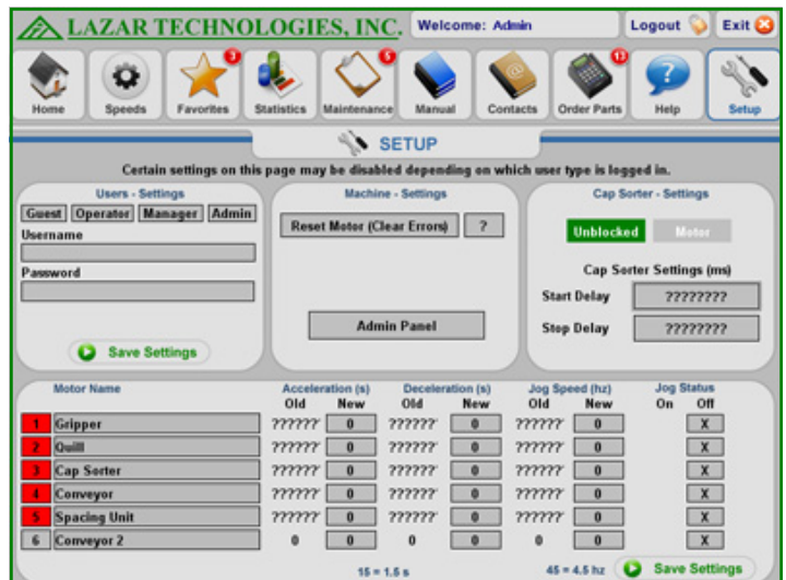
"Admin Setup" section of the HMI Lazar-Touch.

The Lazar Capping Systems are proudly manufactured in the U.S.A.