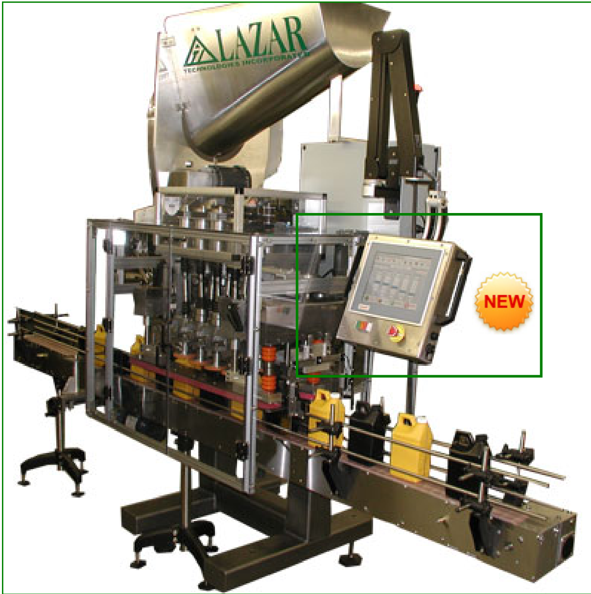
Lazar Capping System Model LC40 with added HMI Lazar-Touch Screen

The Lazar Capping Systems are proudly manufactured in the U.S.A.