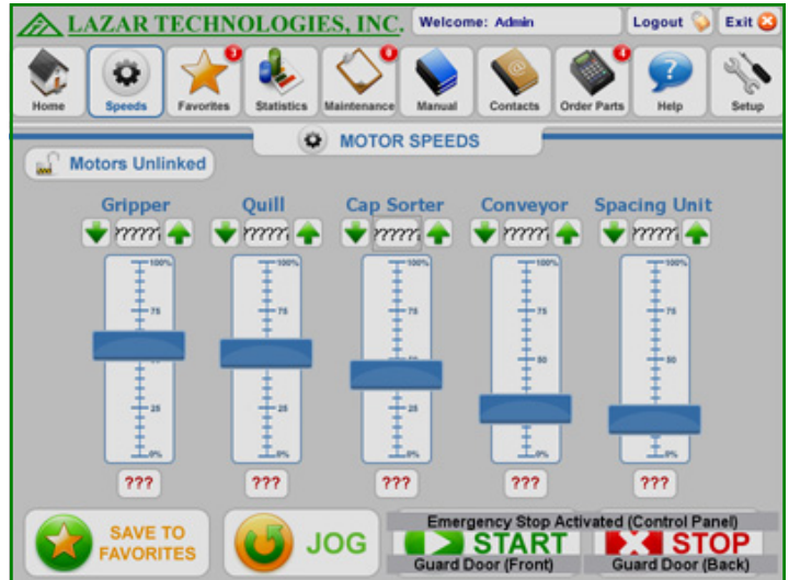
"Speeds" section of the HMI Lazar-Touch.