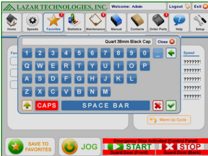
On-Screen Keyboard of the HMI Lazar-Touch.