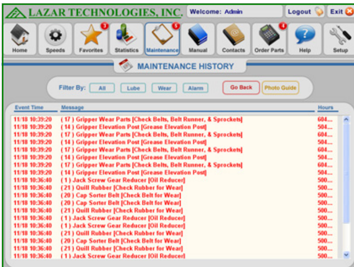
"Maintenance History" section of the Lazar Touch.