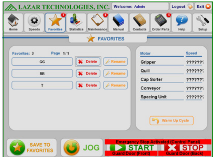
"Favorites Recipe" section of the Lazar-Touch.